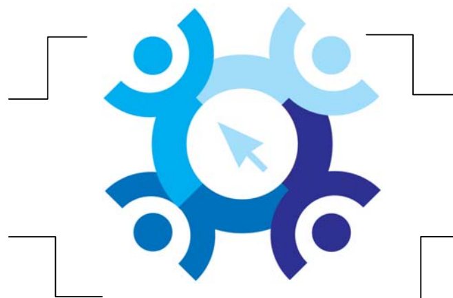
Circular Motion depicts "constant" progression and 360 degrees

The use of FOUR shades represent both vivid opportunities as a result of learning initiatives, and also represent the diversity offered by the Commission.