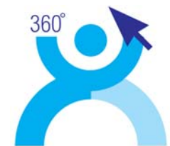
[ Employability Skills ]

Joining of the four figures forms a learning consortium that represents interaction and "collective benefit".